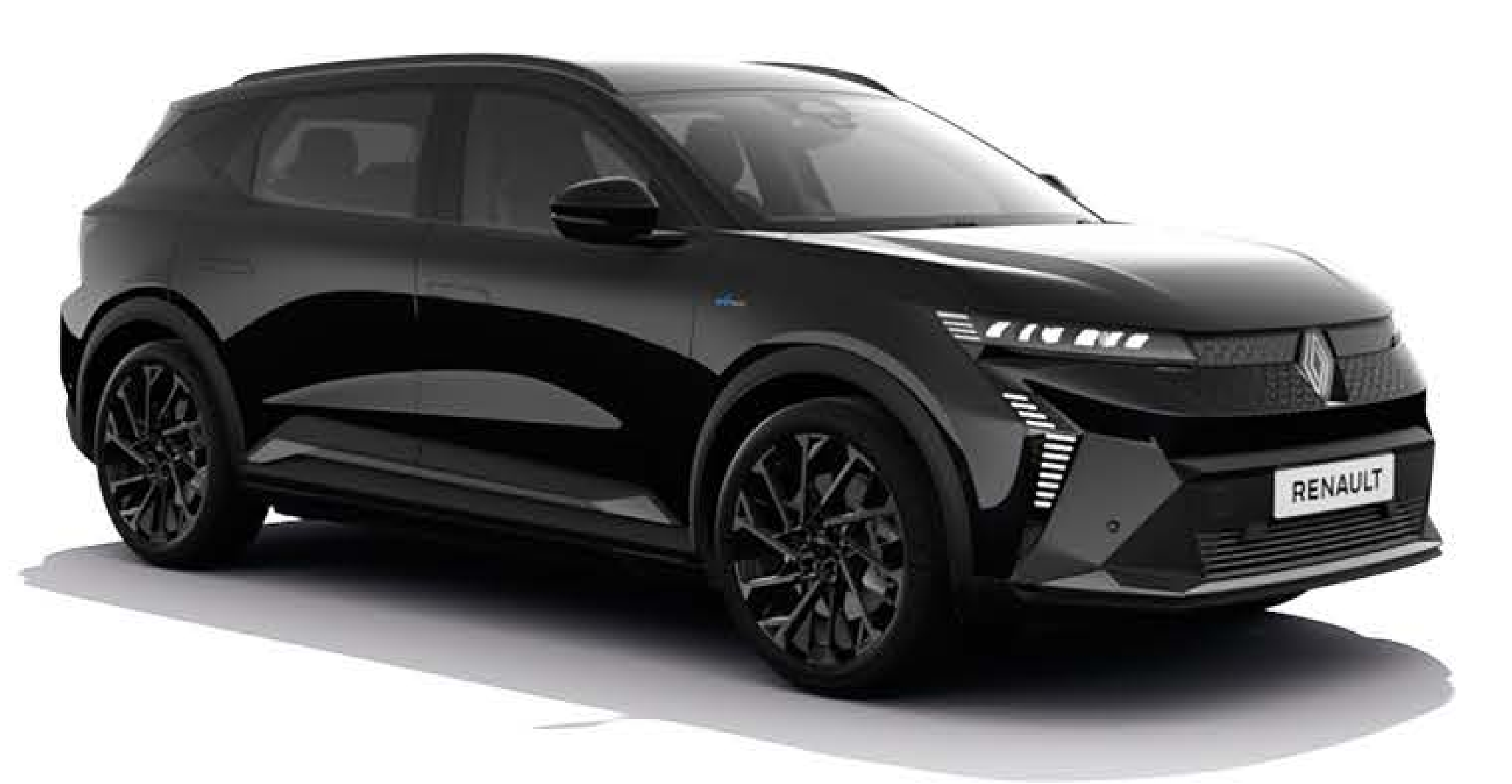
New Renault Scenic E-Tech Electric