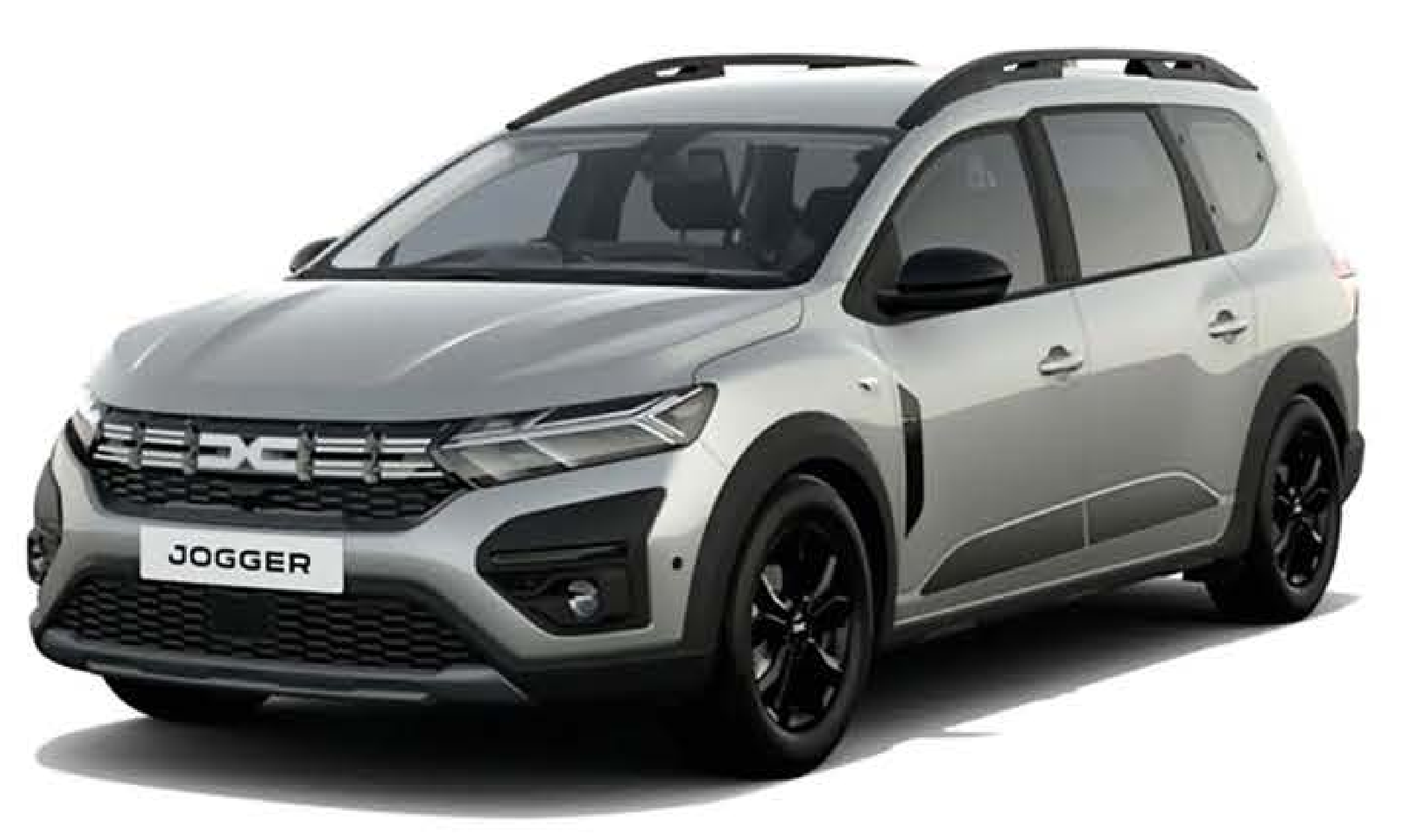
New Dacia Jogger (7 seater)