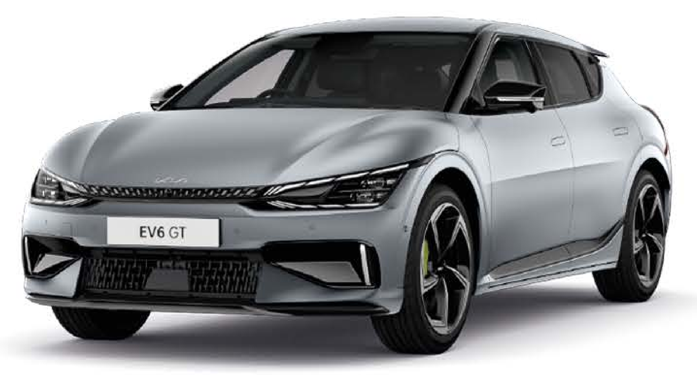
Kia EV6 GT